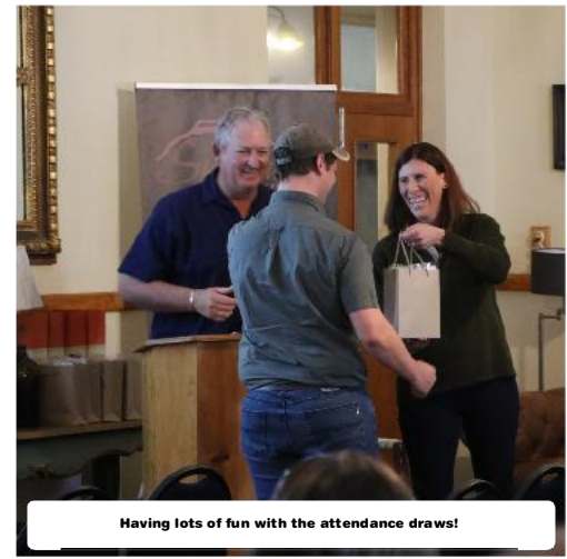
Having lots of fun with the attendance draws!